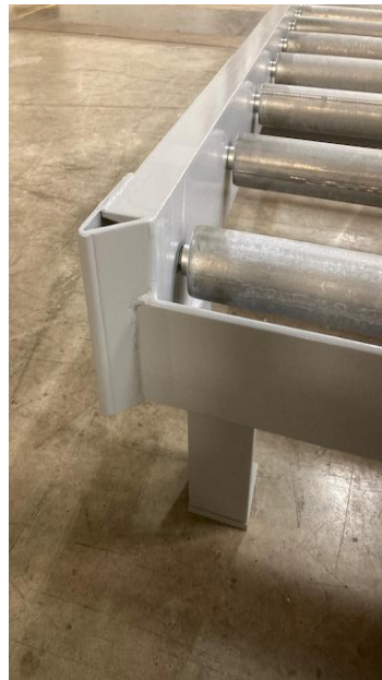
Heavy Duty Framing