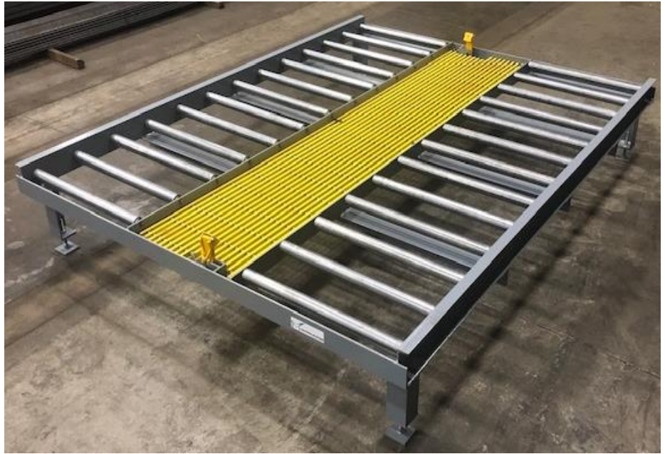
MAXSON AVIATION Static Rack (End Load Version)